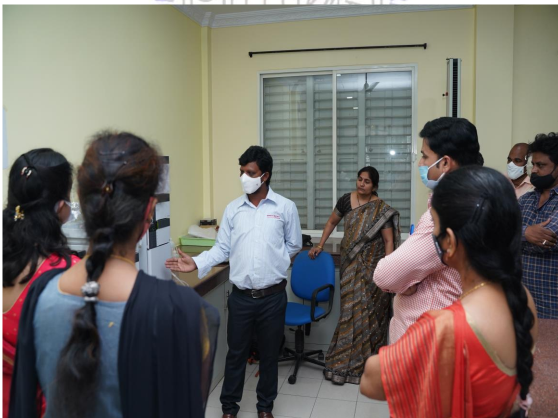
Training oh HPLC PDA for teaching staff