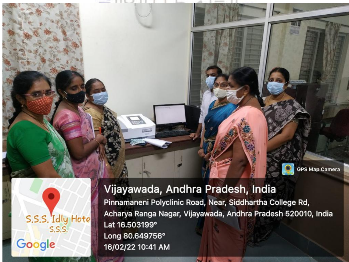
Training on UV- Vis Spectrophotometer for Lab Technicians