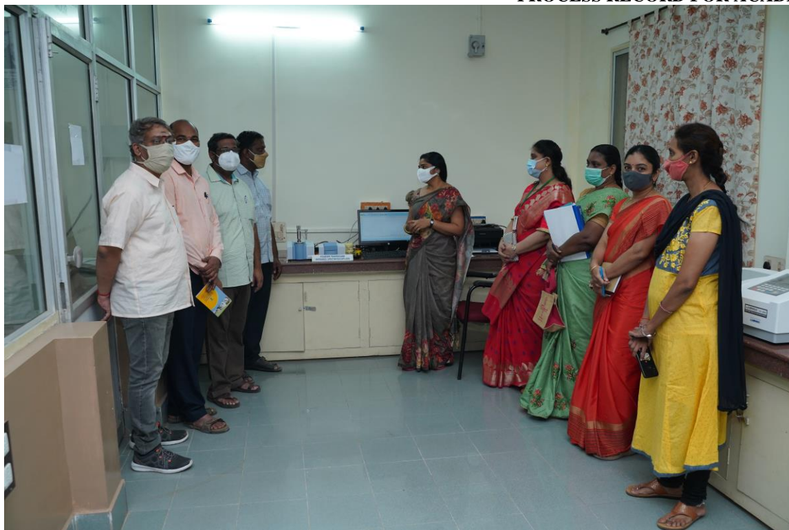
Hands on training on FTIR for teaching staff