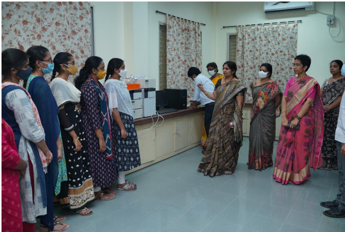
Training on HPLC for students